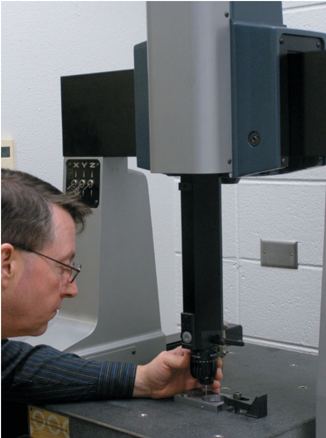
Figure A-3 Quality control technician using a CMM to inspect a part.

They may further their education by taking supervisory management classes at a local technical college, community college, or university.