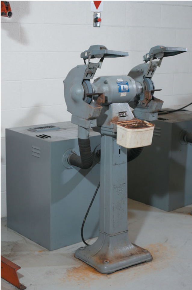
Figure A-4 Dust collector installed on grinder.

and determine what health problems both short- and long-term exposures can cause. In the past, exposure to hazardous chemicals was often neglected until serious health problems began to appear, sometimes many years after exposure. Today, in the industrial world, exposure to chemicals has become a keenly studied subject because it is not always known what the results of long-term exposures can mean to lifetime health issues. Chemical hazard awareness programs label chemicals to make employees aware of particular fire, health, and reactivity issues.