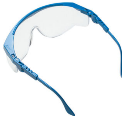
Figure A-5 Safety glasses.

Generally, the machine shop presents a modest, but real hazard to the feet. However, there is always a possibility that you could drop something on your foot. A safety shoe with