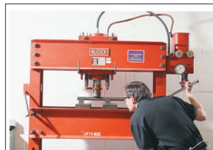
Figure B-19 Pressure being applied to straighten shaft.

Extensive use of color photographs provides you with views of actual machining operations.