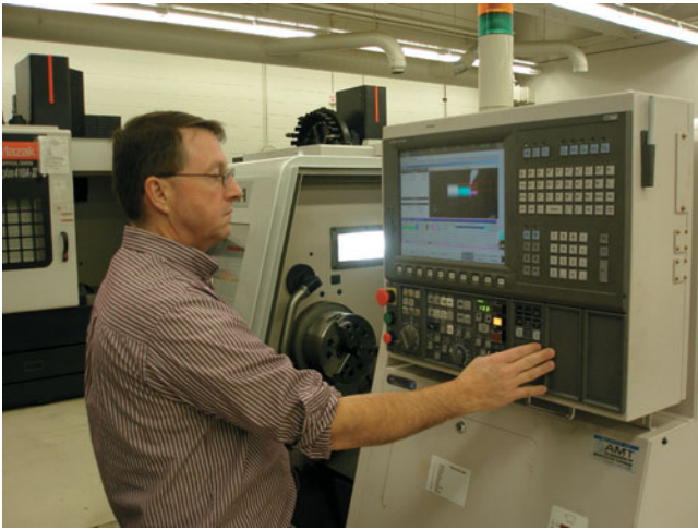
Figure A-2 Machinist programming a part on a CNC turning center (Courtesy of Fox Valley Technical College).

is typically four years and is a combination of on-the-job experiences and formal classroom education. Serving an apprenticeship represents one of the best methods of learning a skilled trade. Upon successful completion of the apprenticeship a journeyman's card is issued to the machinist.